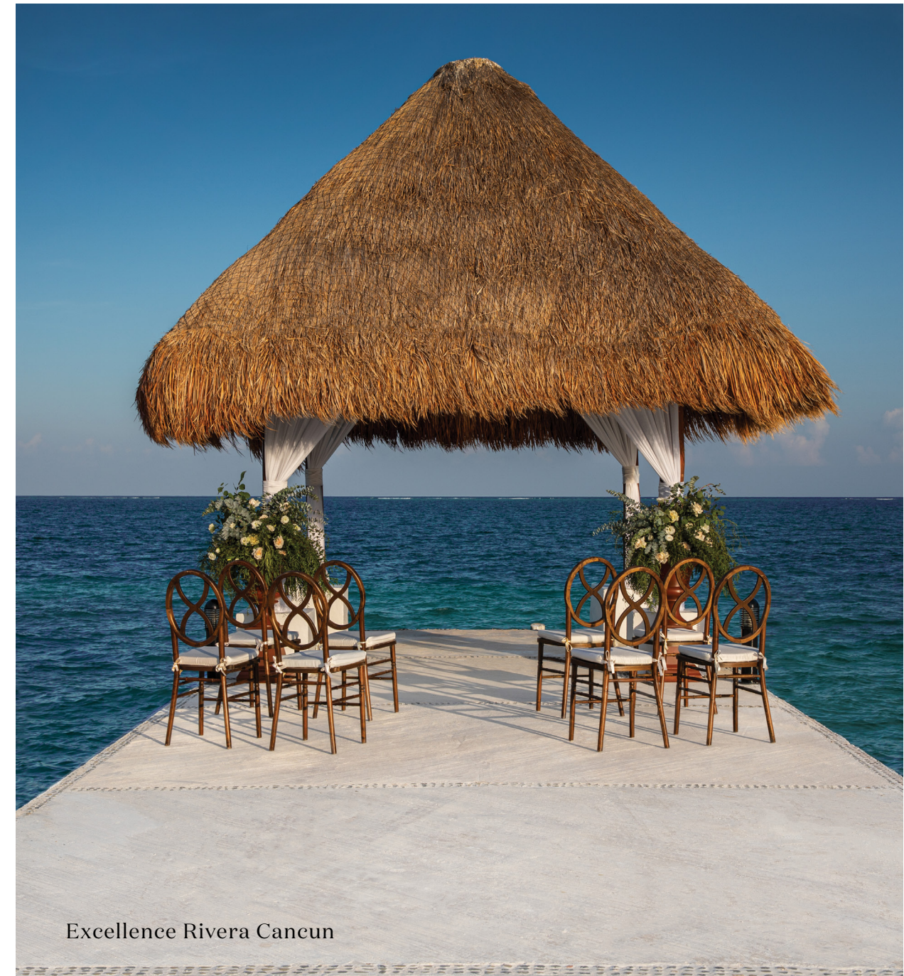
Excellence Riviera Cancun

The Wedding Sales Coordinator will then email the Wedding confirmations and introduce you to the Wedding Planner to work out all the other details of the wedding.