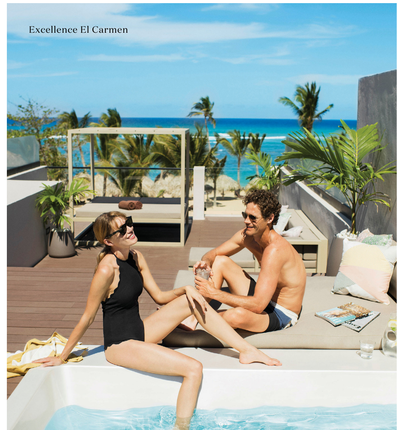
Excellence El Carmen