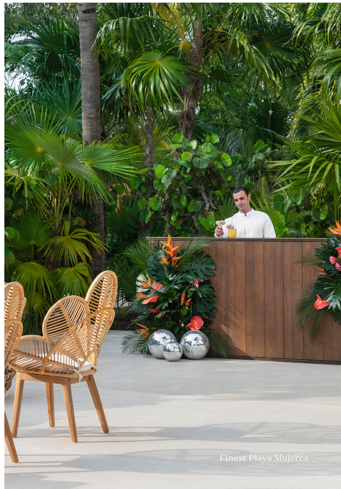
Finest Playa Mujeres