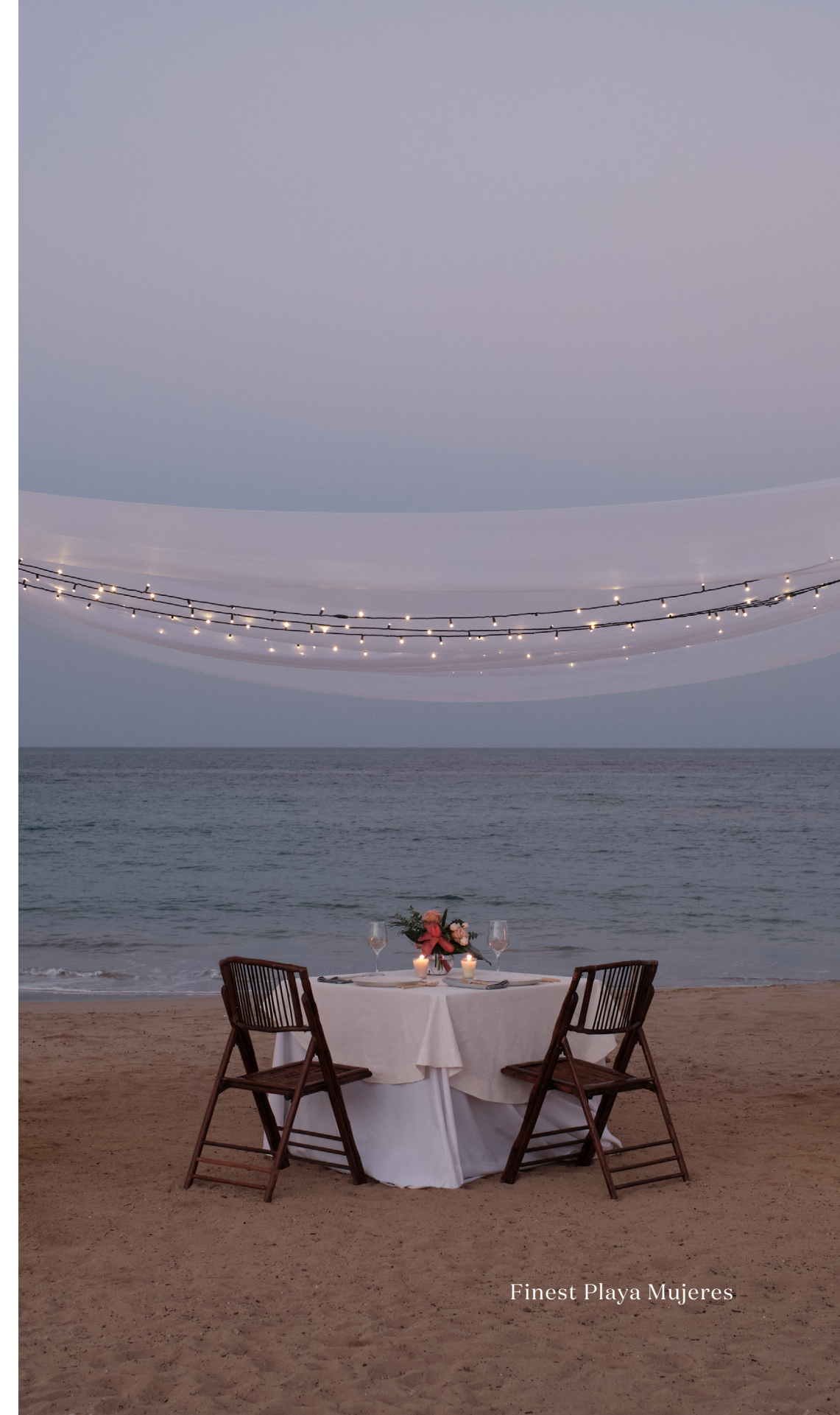
Finest Playa Mujeres

APPLICABLE PROPERTIES: Excellence Riviera Cancun, Excellence Punta Cana, Excellence El Carmen, Finest Playa Mujeres and Finest Punta Cana